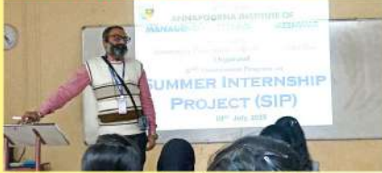
An overview Session on SIP