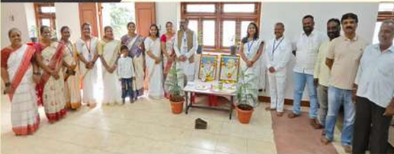
The Institute had celebrated the 79 th Independence Day and the 78 th year of Independence