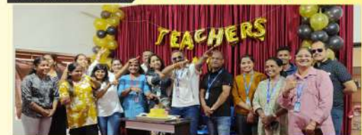
The Institute celebrated 'Teachers Day' on the occasion of Dr. Sarvepalli Radhakrishnan's birth anniversary